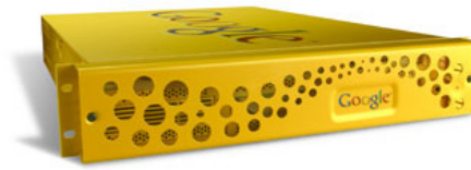
Figure 4 – Google Search Appliance – ten million docs in a box

As a counterpoint, Kimberly-Clark addressed their entire internal search needs with a few simple GSA boxes, each of which looks like this: